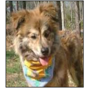
Bandit Adopted 2002