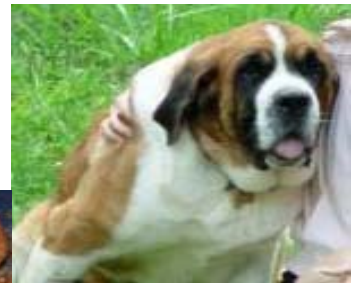
Princess Boinka Today

her shoulders or haunches. Her fur crawled with lice, her ears were filled with ticks, and open wounds freckled her wobbly frame. Blood work showed her to be heartworm positive. After being taken into CARE's foster system and receiving medical attention, heartworm treatment, and lots of TLC from her foster family, now 6 months later, the Princess is in good health, having filled out to a weight of 110 pounds. Even better, Princess Boinka is going to her new home in a few weeks. We wish to express our deep gratitude to all of our supporters, and particularly those who contributed to CARE on behalf of Princess Boinka. It is through your donations that we are able to help restore the health of such neglected animals. Thank you for making possible a fairy tale ending for one very special dog!