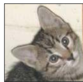
Blake Adopted 2002