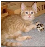
Buzz Adopted 2003