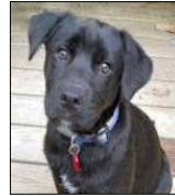
Benny Adopted 2003