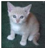
Biscoe Adopted 2003