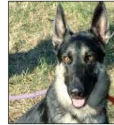
Apollo Adopted 2001