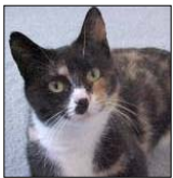
Cecelia Adopted 2002