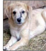
Abbie Adopted 2002